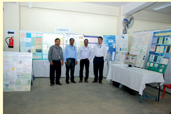
Scientists at C-MMACS Stall at the Technology Exhibition organized on the occasion of CSIR Foundation Day on 26th September 2010